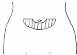
Belly Button (navel)