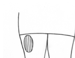
Upper Outer area of the thigh